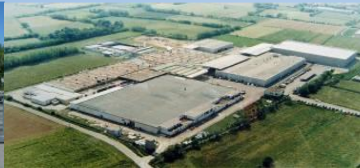
Weaving, printing, dyeing and finishing plant at Pontirolo Nuovo, near Milan