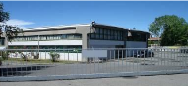
Acrylic spinning at Zone, near Brescia

INNOVATION AND PRECISION IN TEXTILE DESIGN AND MANUFACTURE