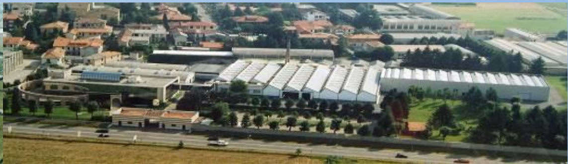
Head office, design centre and main warehouse at Sovico, near Como